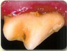
Moderate periodontal disease: Pustular discharge, bleeding and moderate bad breath.