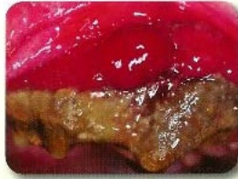
Advanced periodontal disease: Bleeding gums, mobile teeth and very bad breath.

Dental care is another important way to keep your pet healthy. Dental infections lead to bacteria in the bloodstream, which puts additional wear and tear on the internal organs. Keeping teeth and gums healthy with brushing is the best, but you can also utilize dental chews, prescription dental dog foods and dental treats.