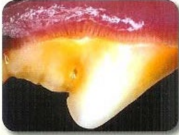
Gingivitis: Plaque and slightly disagreeable mouth odor.