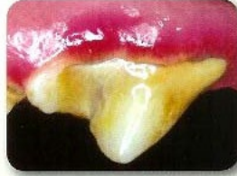
Early periodontal disease: Gum inflammation, swelling and bad breath.